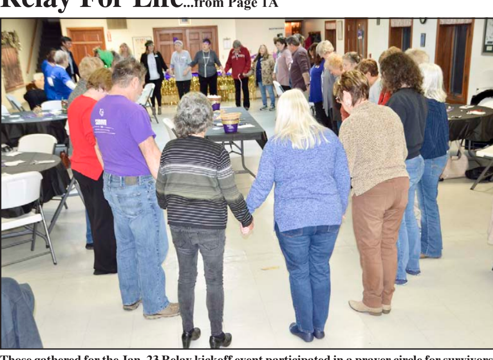
Those gathered for the Jan. 23 Relay kickoff event participated in a prayer circle for survivors, volunteers and 2020 Relay For Life efforts.

labs. We are at the far end of the spectrum of cancer research, and we talk about the standard of care. Standard of care is really what we offer at the cancer clinic.